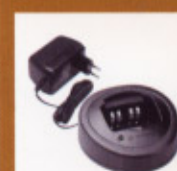
Rapid-rate Desktop Charger PMTN4025