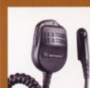
Remote Speaker Microphone PMMN4002