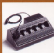
Multi-unit Charger PMTN4028