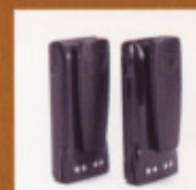
NIMH Battery & Belt Clip PMNN4008