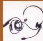
Light Weight Head Set AZRMN4018

A comprehensive range of accessories is available so that the radios can be customised to suit your needs. Adding the proper headsets, microphones, batteries, chargers or carry cases can enhance the productivity of the people who use two-way radios. Motorola accessories are built with the highest quality standards and are specially engineered to assure maximum performance of your radio, no matter what profession you're in.