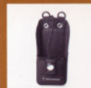
Carry Case HLN9701